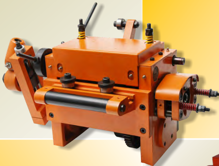
Normal Speed Series JSM - 100

High Quality Product for Coil-Feeding in Press-Room