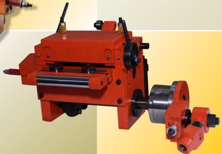
High Speed Series JSM - HS - 100